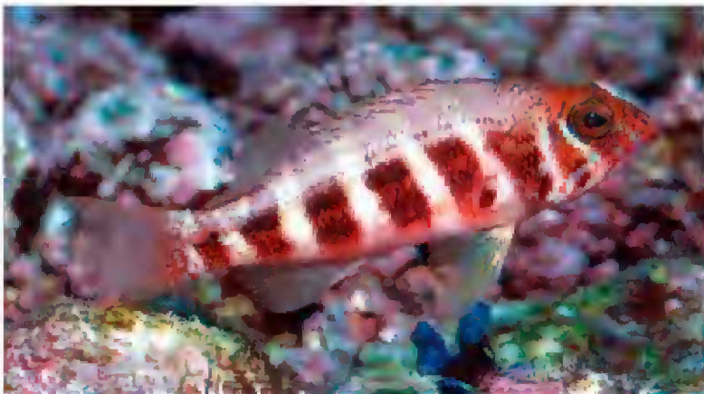
FIGURE 12. Serranus heterurus from the Cape Verde Islands.